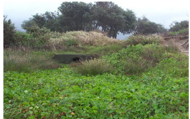
Outlet design included in 2003 Coastal Plan

The storm water outlet re-built by Council in November 2012 is causing severe erosion from the outlet across the width of the beach. We understand the work was done with grant funding from the NSW Government.