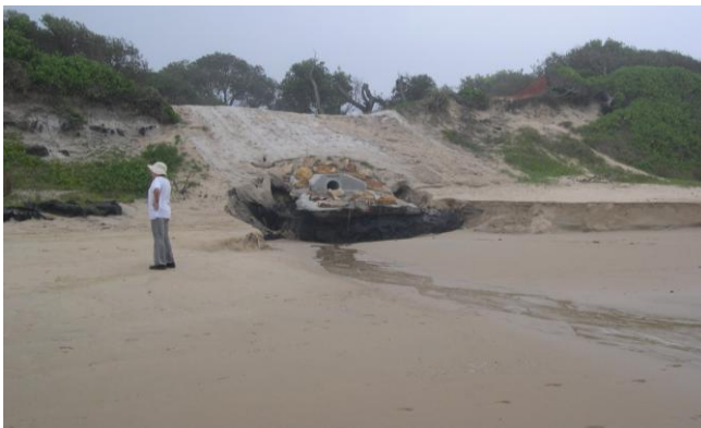
Re-built water outlet at 68 Chepana on 29/01/2013