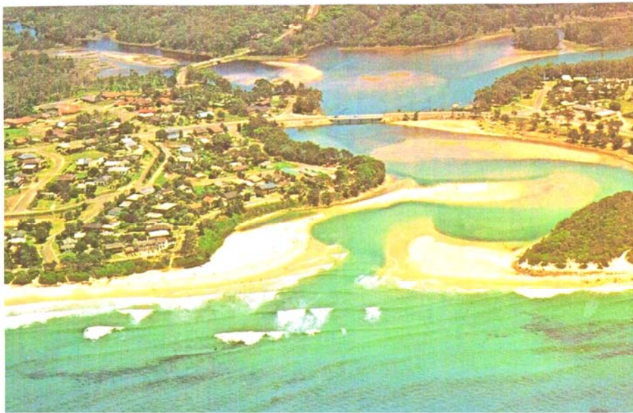
Estuary and new bridge 1973