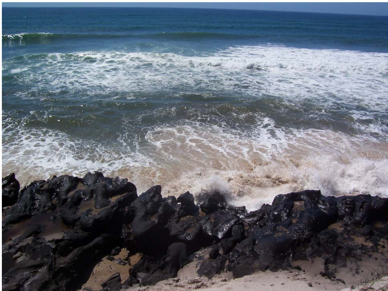
Loss of beach in front of Illaroo Road 2008.