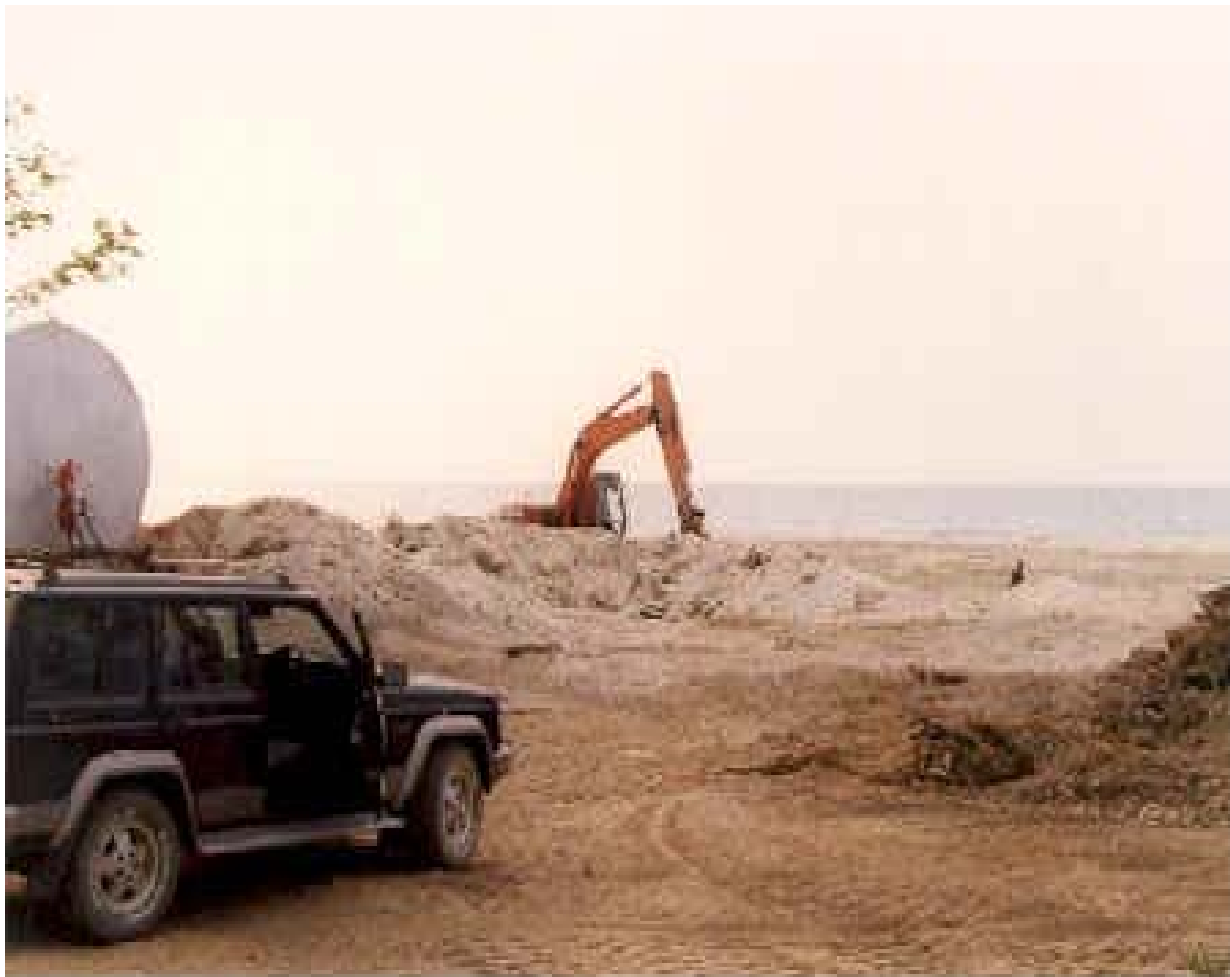
Typical destruction and complete removal of dune during sand mining operations