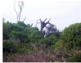
Left: 2006 Bitou up to 8 metres high

The Group began work in 2006 and the images below show a small part of their success in returning the area to its native condition.