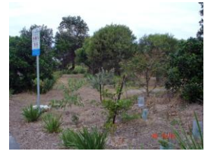
Right: Bitou removed

Landcare's other major success has been the virtual elimination of imported Indian Myna Birds. Again ongoing work is necessary to trap the few unwanted birds as they arrive in the village.