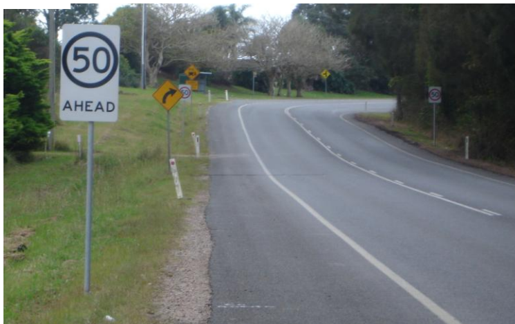
Ocean Drive at Abel Tasman Dr with new 50 speed limits

Six years ago the Progress Association, supported by petitions from parents and other residents, pressed the local Traffic Committee and the RTA to lower the speed limit on this section of road from 80 kmh to 50 kmh.