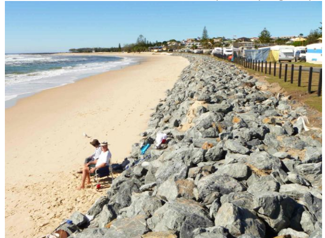
A Revetment at Kingscliff (NSW)

Construction can be of rocks, as above, or concrete. The revetment option is strongly supported by the Progress Association for Lake Cathie's shoreline.