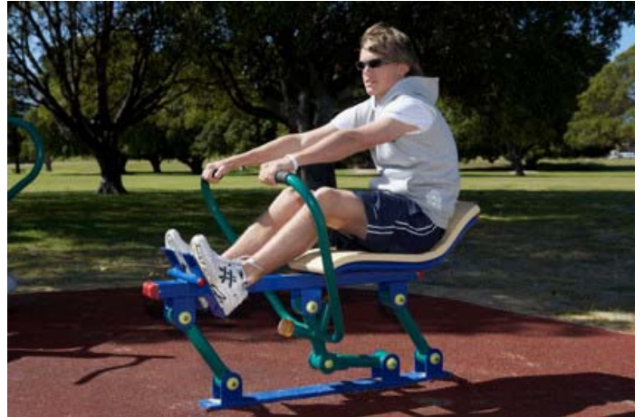
A Rowing machine is one of the designs available

The Progress Association's application for Gym Equipment to be installed at Jonathon Dickson Reserve has been successful.