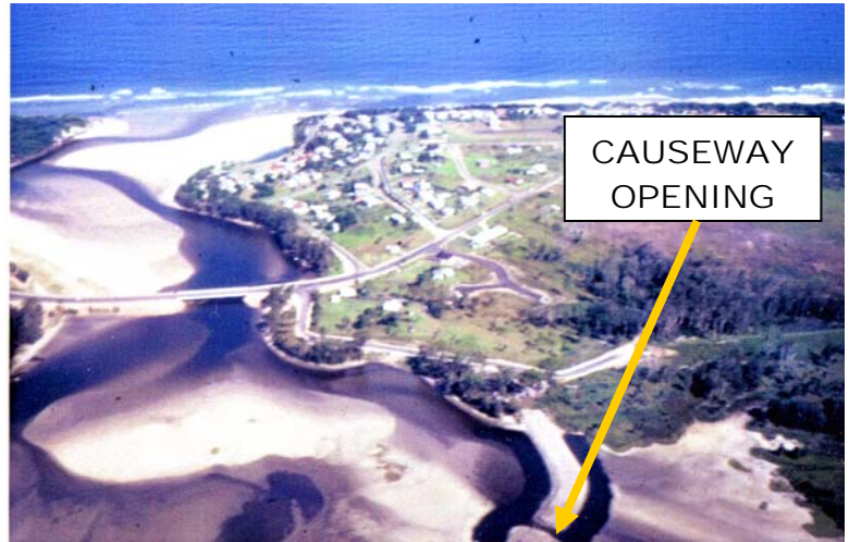
Image of the Causeway during construction. Bridge opening is only 10 metres in a 110 metre span Note the banks were pure white sand - no grass visible.

This ill conceived piece of engineering was constructed in 1972-73, for access to a new residential estate.