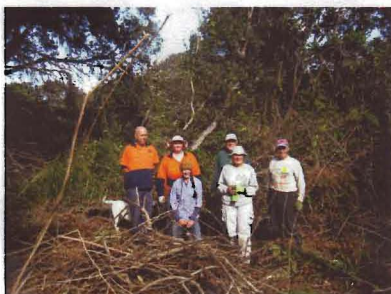
Above: Landcare volunteers clearing lantana with the assistance of the landowner.