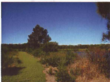
Above/Below: Examples of bush regeneration undertaken by Wild Things Native Gardens